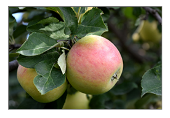
Goodland Apple fruit

Goodland Apple features showy clusters of lightly-scented white flowers with shell pink overtones along the branches in mid spring, which emerge from distinctive pink flower buds. It has forest green deciduous foliage. The pointy leaves turn yellow in fall. The fruits are showy light green apples with a red blush, which are carried in abundance from late summer to early fall. The fruit can be messy if allowed to drop on the lawn or walkways, and may require occasional clean-up.