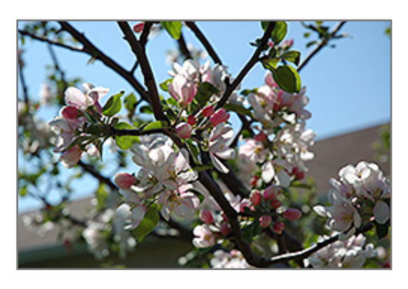
Goodland Apple flowers