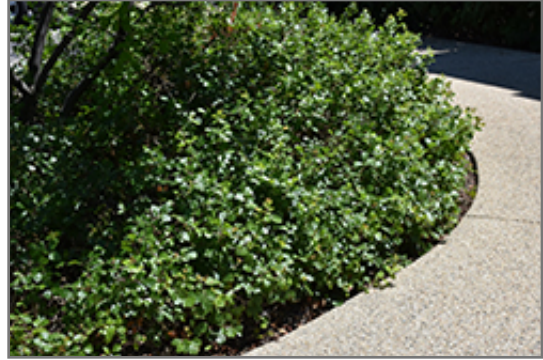
Gro-Low Fragrant Sumac

Gro-Low Fragrant Sumac is recommended for the following landscape applications;