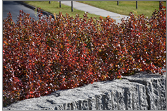
Gro-Low Fragrant Sumac in fall

This shrub performs well in both full sun and full shade. It is very adaptable to both dry and moist locations, and should do just fine under typical garden conditions. It is not particular as to soil type, but has a definite preference for acidic soils, and is subject to chlorosis (yellowing) of the foliage in alkaline soils. It is highly tolerant of urban pollution and will even thrive in inner city environments. Consider applying a thick mulch around the root zone in winter to protect it in exposed locations or colder microclimates. This is a selection of a native North American species.