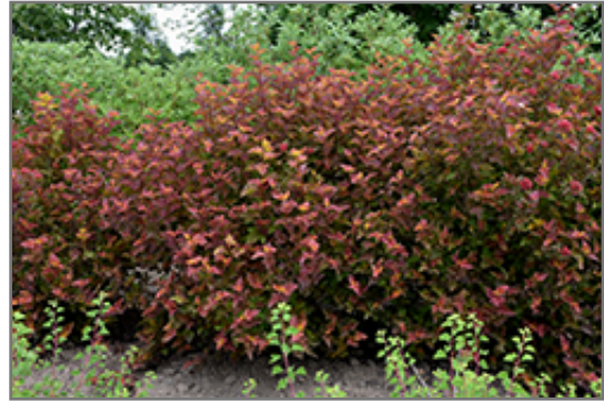
Amber Jubilee Ninebark

This shrub does best in full sun to partial shade. It is very adaptable to both dry and moist locations, and should do just fine under average home landscape conditions. It is not particular as to soil type or pH. It is highly tolerant of urban pollution and will even thrive in inner city environments. This is a selection of a native North American species.