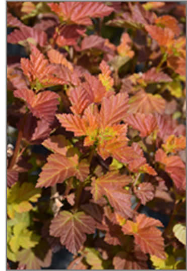
Amber Jubilee Ninebark foliage

This shrub will require occasional maintenance and upkeep, and can be pruned at anytime. It has no significant negative characteristics.