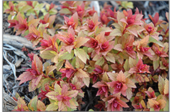
Magic Carpet Spirea foliage

Magic Carpet Spirea will grow to be about 24 inches tall at maturity, with a spread of 3 feet. It tends to fill out right to the ground and therefore doesn't necessarily require facer plants in front. It grows at a fast rate, and under ideal conditions can be expected to live for approximately 20 years.