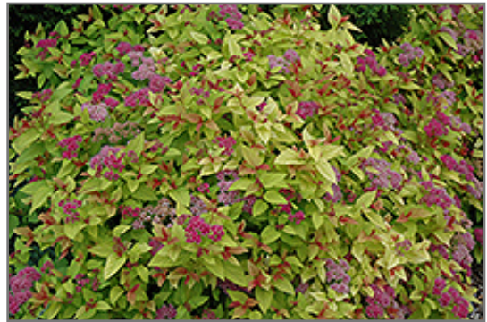
Magic Carpet Spirea flowers

2503-211 Avenue N.E. Edmonton, AB T5Y 6P8