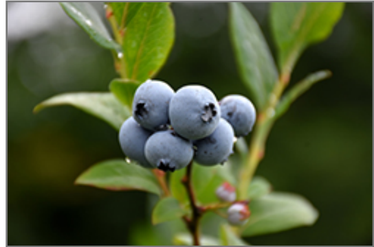
Northsky Blueberry fruit

Northsky Blueberry features dainty clusters of white bell-shaped flowers with shell pink overtones hanging below the branches in mid spring. It has green deciduous foliage. The glossy oval leaves turn an outstanding scarlet in the fall. It features an abundance of magnificent blue berries in mid summer.