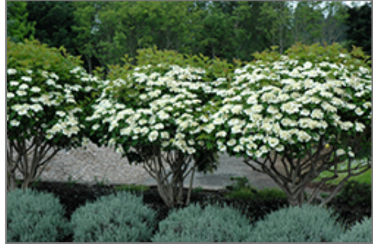
Compact European Cranberry in bloom

Compact European Cranberry is a dense multi-stemmed deciduous shrub with a more or less rounded form. Its average texture blends into the landscape, but can be balanced by one or two finer or coarser trees or shrubs for an effective composition.