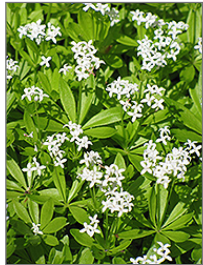
Sweet Woodruff flowers