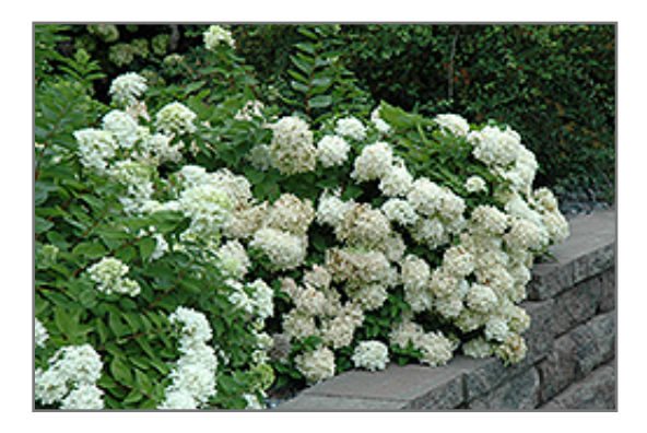
Pee Gee Hydrangea in bloom