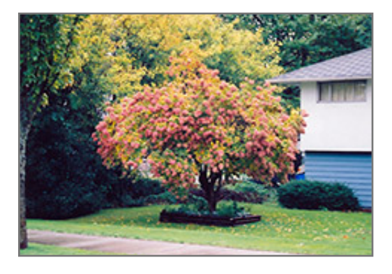
Pee Gee Hydrangea in bloom