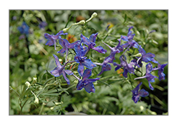
Blue Butterfly Delphinium flowers

Blue Butterfly Delphinium is recommended for the following landscape applications;