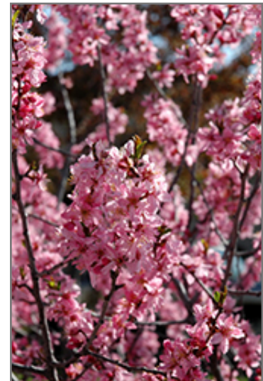
Muckle Plum (tree form) flowers