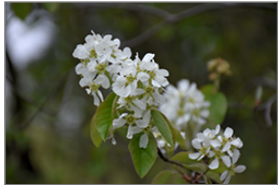
Saskatoon flowers

Saskatoon is a multi-stemmed deciduous shrub with an upright spreading habit of growth. Its relatively fine texture sets it apart from other landscape plants with less refined foliage.