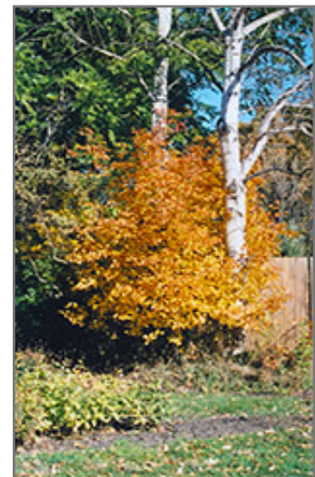
Saskatoon in fall