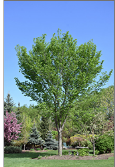
Brandon Elm