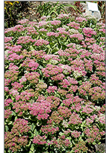
Brilliant Stonecrop in bloom