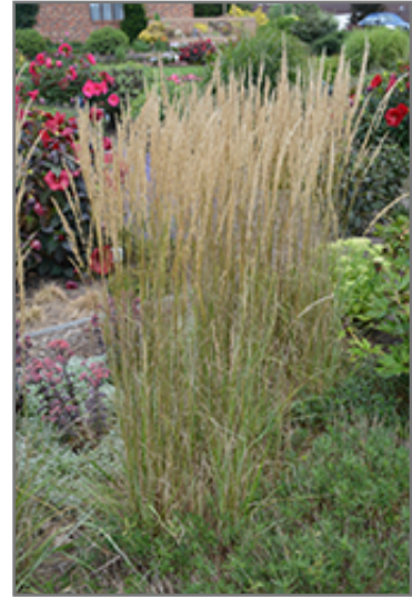
El Dorado Feather Reed Grass

El Dorado Feather Reed Grass is recommended for the following landscape applications;