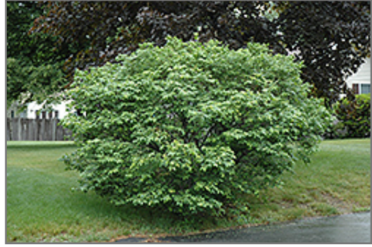
Compact Winged Burning Bush

Compact Winged Burning Bush will grow to be about 7 feet tall at maturity, with a spread of 7 feet. It tends to fill out right to the ground and therefore doesn't necessarily require facer plants in front, and is suitable for planting under power lines. It grows at a slow rate, and under ideal conditions can be expected to live for 50 years or more.