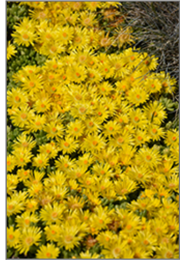
Yellow Ice Plant flowers

Yellow Ice Plant is recommended for the following landscape applications;