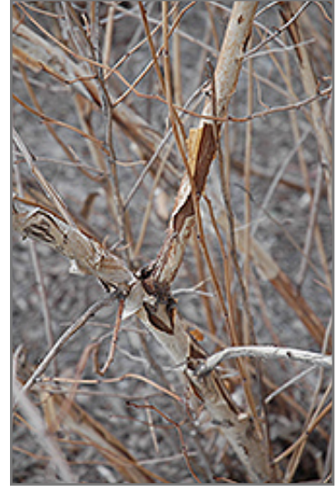
Diablo Ninebark bark

This shrub does best in full sun to partial shade. It is very adaptable to both dry and moist locations, and should do just fine under average home landscape conditions. It is not particular as to soil type or pH. It is highly tolerant of urban pollution and will even thrive in inner city environments. This is a selection of a native North American species.