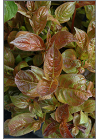
Wings Of Fire Weigela foliage