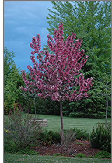
Rudolph Flowering Crab in bloom

Rudolph Flowering Crab is recommended for the following landscape applications;