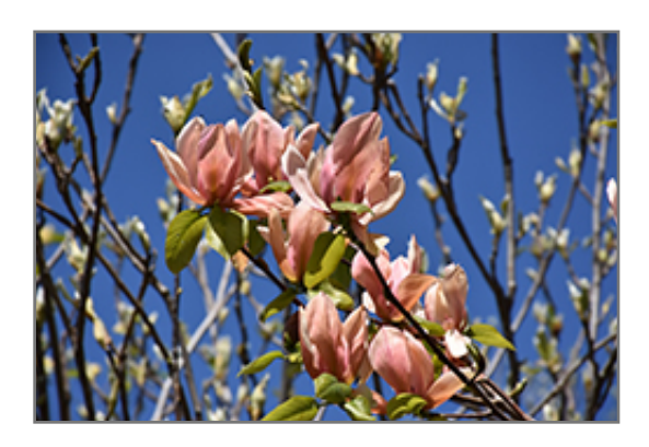
Coral Reef Magnolia flowers

Coral Reef Magnolia will grow to be about 20 feet tall at maturity, with a spread of 15 feet. It has a low canopy with a typical clearance of 2 feet from the ground, and is suitable for planting under power lines. It grows at a medium rate, and under ideal conditions can be expected to live for 50 years or more.