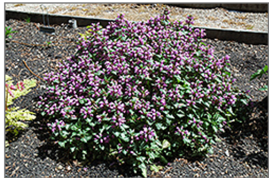
Beacon Silver Spotted Dead Nettle in bloom