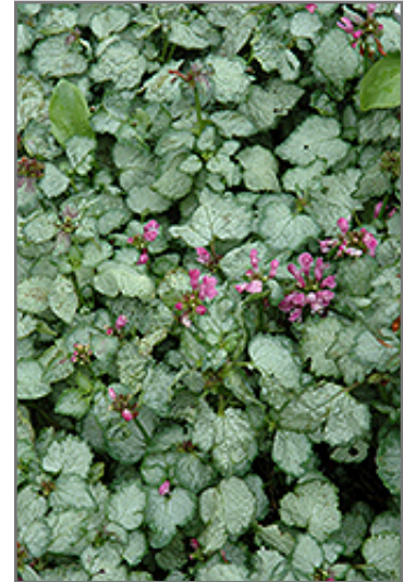
Beacon Silver Spotted Dead Nettle flowers