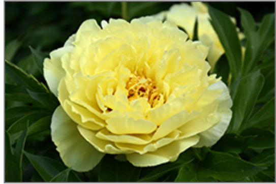
Yellow Crown Peony flowers