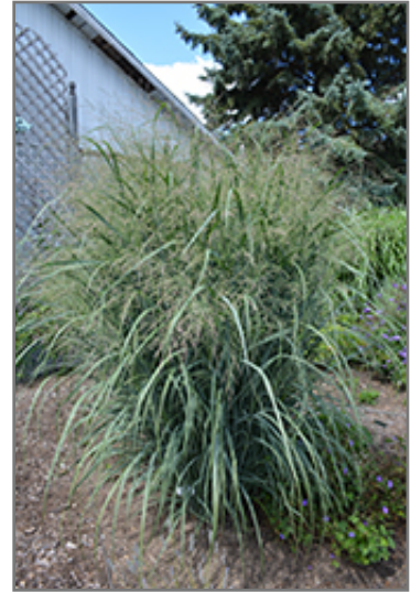
Northwind Switch Grass in bloom

This plant does best in full sun to partial shade. It is very adaptable to both dry and moist locations, and should do just fine under typical garden conditions. It is considered to be drought-tolerant, and thus makes an ideal choice for a low-water garden or xeriscape application. It is not particular as to soil type, but has a definite preference for alkaline soils, and is able to handle environmental salt. It is somewhat tolerant of urban pollution. This is a selection of a native North American species. It can be propagated by division; however, as a cultivated variety, be aware that it may be subject to certain restrictions or prohibitions on propagation.