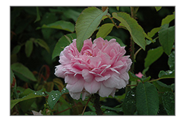
Jacques Cartier Rose flowers