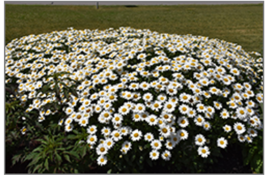
Becky Shasta Daisy in bloom

2503-211 Avenue N.E. Edmonton, AB T5Y 6P8