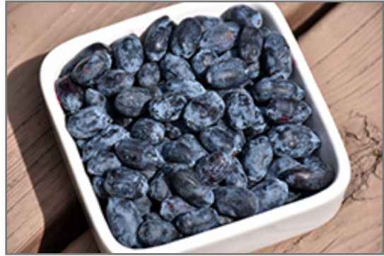
Boreal Beast Honeyberry fruit

This is a dense multi-stemmed deciduous shrub with a more or less rounded form. Its average texture blends into the landscape, but can be balanced by one or two finer or coarser trees or shrubs for an effective composition. This plant will require occasional maintenance and upkeep, and is best pruned in late winter once the threat of extreme cold has passed. It is a good choice for attracting butterflies to your yard. It has no significant negative characteristics.